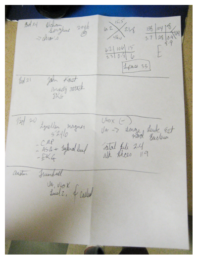
Figure 1. A personal note used by ED resident

and photos of artifacts for emergent themes using open coding [6]. After informal documentation practice was chosen as the main theme, we followed a process of comparing informal documentation artifacts. We coded types of information present on different artifacts, such as "planning future work," then re-analyzed artifacts with these categories in mind, thus refining and defining categories of informal documentation practice.